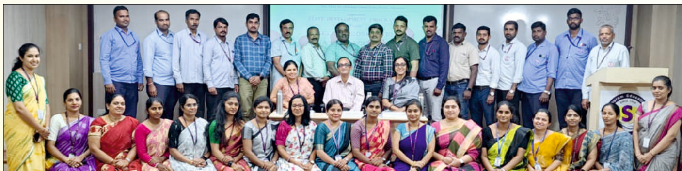
In-house faculty development programme